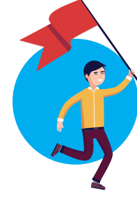
A SPIRIT OF LEADERSHIP