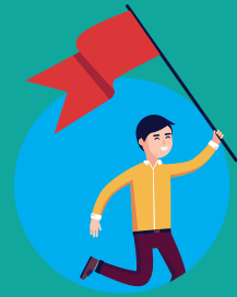
A SPIRIT OF LEADERSHIP